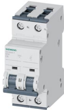
Miniature circuit breaker 230 V 6kA, 1+N-pole C, 6 A, D=70 mm